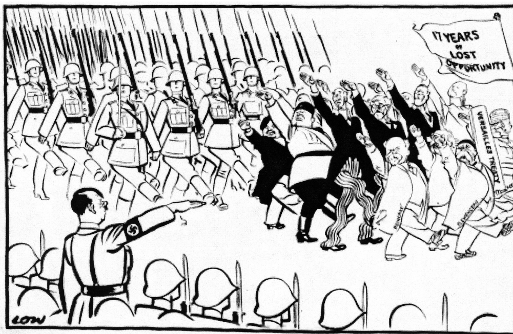
A cartoon, entitled 'Cause Precedes Effect', published in a British newspaper, 1935. It shows a parade of world statesmen led by the Versailles peacemakers.