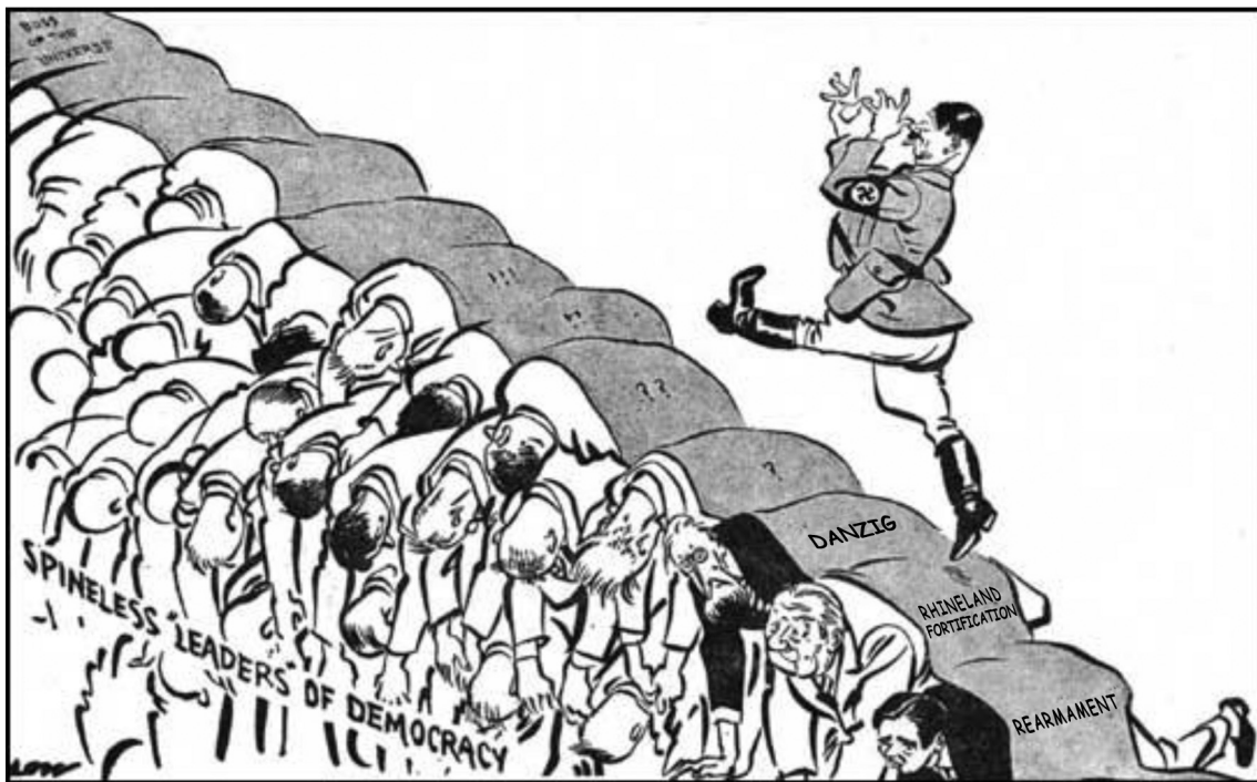
A cartoon, entitled 'Stepping Stones to Glory', published in a British newspaper, July 1936.

Written by Lloyd George at the time of the peace talks in 1919.