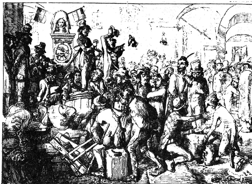
A cartoon published in Germany in 1848 entitled 'Parliament of the future'.